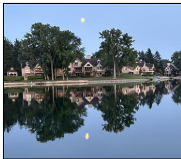
A couple of beautiful moon sightings.