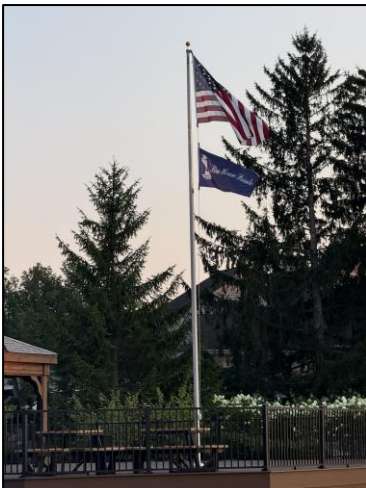
New flags replaced the tattered ones flying over the Pavilion

Repairs are being made to the most severely washed-out beaches to improve the water overflow in heavy rains.