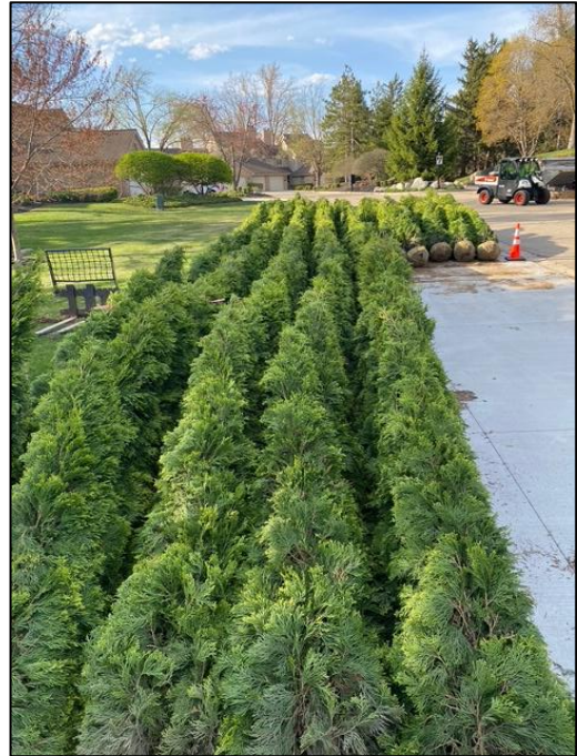
The arbs are here!

The BHP Annual Meeting has again been rescheduled for October 8 th .