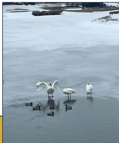
Our swans are back!